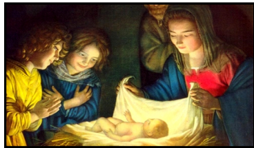
Angels and Baby Jesus

that they were bearers of good news. I said to them: "You see my embarrassment, so please fill this entire place and stand by each person. Remove any heaviness! Let the joy overflow, let the atmosphere be light, cheerful, and let the message go straight to their hearts!"