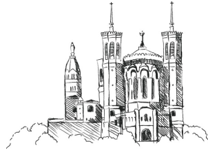
Basilica of Fourvière

is very sick, it is her ear, and she will probably need surgery. She is 5 years old. So, here's the thing: you are Jewish, and with Jews we can make deals. You heal my daughter, and I promise to give my life to your Son, it's a two-way street. Are you OK with that?"