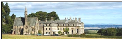
Medjugorje Centre (North East)

The Holy Father has asked that 2024 be year of prayer, as a preparatory year for the Jubilee. This will start in Advent 2023. In preparation for the Jubilee, dioceses are invited to promote initiatives to remind people of the centrality of both individual prayer and community prayer.