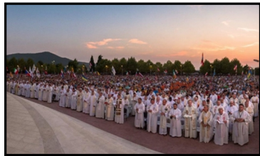
707 Priests Concelebrate at Youth Festival

to forgive all those who wanted to harm him. Moreover, in this unexpected outpouring of mercy, he received the inner certainty that if he forgave all this evil, the Lord himself would protect and defend him in everything. And that is what happened. The badmouthing stopped. From then on, his priestly heart was solidly mended. Today he is a happy priest. He sees this blessing from God, as the great light of his life as a priest, the burst of a divine joy that freed him from fear and sadness. Once again, the living Word of Christ unlocked this heart that had been trapped in bitterness for years.